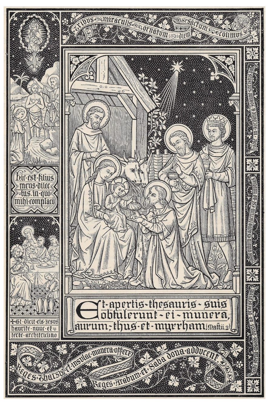
10-13 January 2023