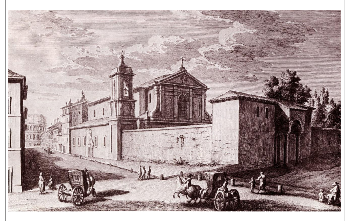
Fridays in Lent Stations of the Cross & Benediction 6.30

Wednesday, 25 March Annunciation B.V.M. Procession & Solemn Mass 7.00